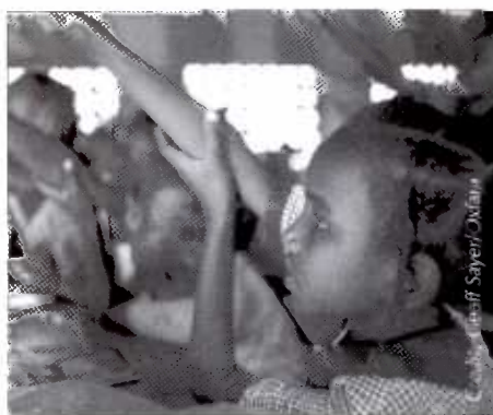
A Kenyan school girl raises her hand. Gender mainstreaming in education should enable all girls and boys to participate fully in school

These experiences suggest that as well as ensuring that a gender perspective is mainstreamed through all aspects of education policy and practice, maintaining a specific focus on gender, women and girls is also important. It is essential that interventions at all levels of education, as well as education budgets and plans,