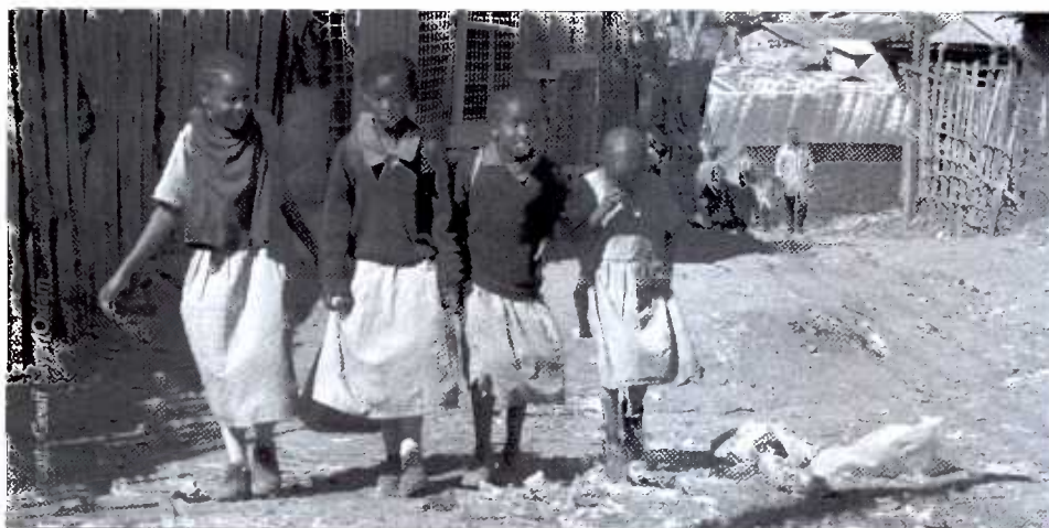
Girls walking home after school. CEF partners are working to ensure that receiving a quality education becomes a reality for all girls and boys in Kenya