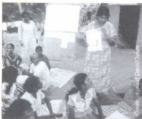
Gender training is often an important component of mainstreaming. These women are participating in a workshop about domestic violence in Sri Lanka

In practice, the ways in which different organisations have incorporated gender mainstreaming into their work has varied. In some cases organisations have focused on ensuring that gender is considered more comprehensively in their programmatic activities but have paid less attention to the ways in which the internal organisational structures and practices may be gendered in ways that maintain and reproduce inequality. In others the reverse may be true with more attention given to gender within the internal workings of the organisations and less to the gendered impact of programme activities. Where the responsibility for gender mainstreaming lies also differs between organisations. In some organisations gender experts or units are responsible for ensuring that gender is mainstreamed effectively across the organisation. In other cases it is considered that the responsibility for mainstreaming should lie with all staff members and not with particular individuals or teams.