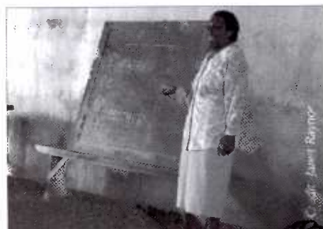
Learning subordinate status? Fathers and brothers are shown to have dominant positions at home in a pre-school class

Meanwhile, because the number of girls enrolled was increasing, and because there was a unit within KESSP that 'dealt with' gender, there was perhaps a loss of focus on gender in other parts of the programme. However, since the introduction of free