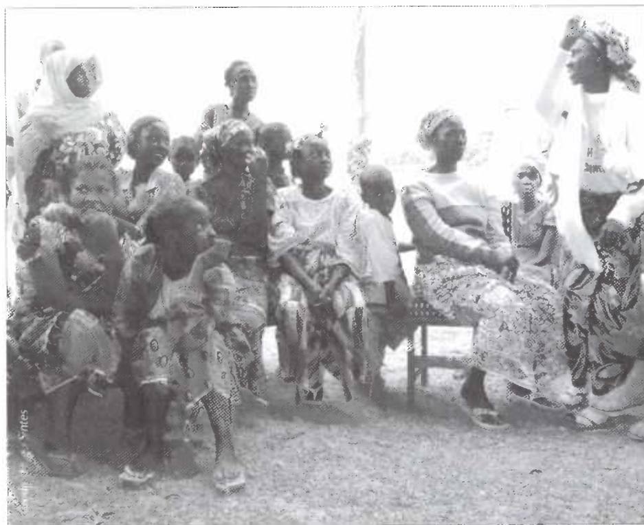
Gender mainstreaming requires women as well as men to be considered at all stages of project planning and implementation. These women in Liberia are ensuring that their opinions are taken on board in the design of a new project

Gender mainstreaming as a strategy for women's empowerment is controversial, difficult, but as important now as it was for its supporters more than a decade ago. In September 1995, representatives from 189 governments & more than 5000 participants from over 2000 non-governmental organisations at the Beijing Fourth World Conference on Women, convened by the United Nations ratified the Platform for Action as a transformatory global agenda for achieving gender equality and women's empowerment. Gender mainstreaming was identified as the key strategy. But in the years that followed neither the ideals nor the strategy have been easy to fulfil.