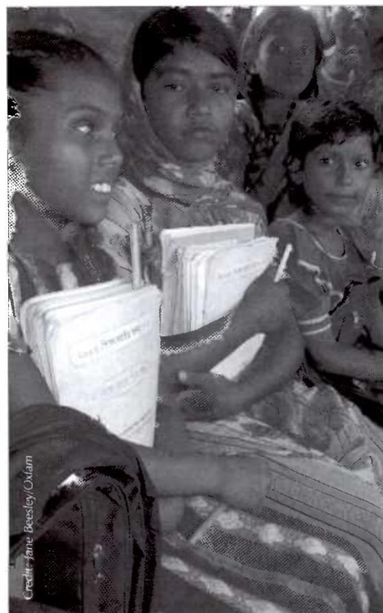
Bangladeshi school girls with their books